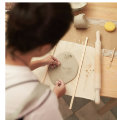
Image: Stuart Town Public School, Same Butt Different , 2025, mixed media.

Join us in celebrating the Official Opening of the Waste 2 Art 2025 Regional Showcase , featuring the winning Waste 2 Art artworks from participating Councils in the Netwaste region. Free event, registration essential.