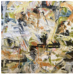
Image: Margaret Lynch, Miss Demeanour , 2025 (detail), mixed media.

Waste 2 Art is a community art exhibition and competition that aims to educate, inform, and challenge the way we look at waste in our communities. Students and community members are encouraged to create artworks that are made from materials that would normally be thrown away as waste.