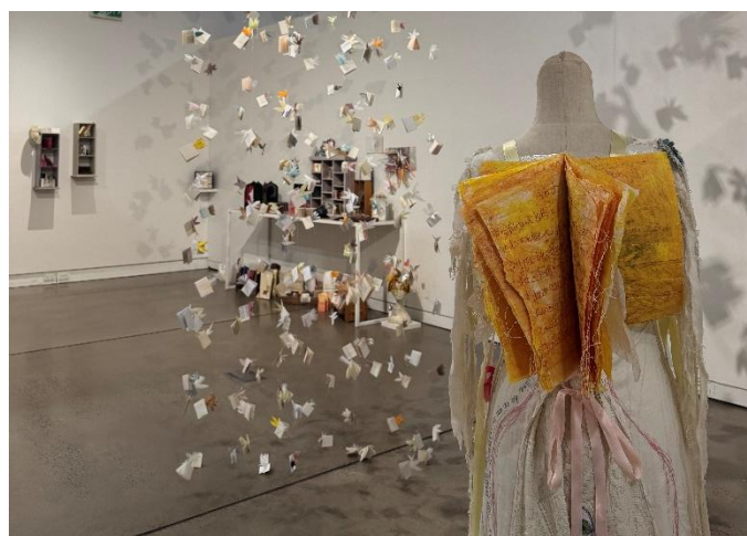
Bookish:Tina Pech Installation view, HomeGround 1 March – 25 May 2025