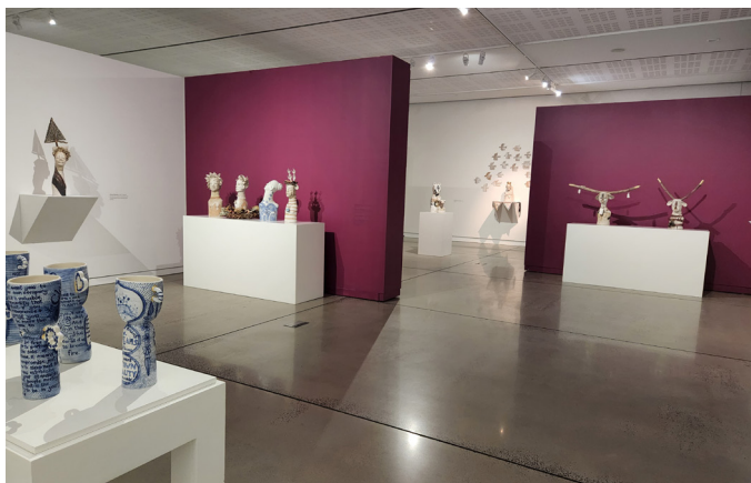
Not Fragile Like a Flower: Melissa Kelly, Installation View, HomeGround 9 July - 18 September 2022

Please contact the Curatorial Team from the WPCC or your local RADO who will be happy to assist