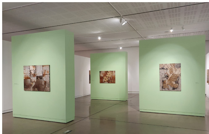
Sang into Existence: Anna Nordstrom, Installation View, HomeGround 12 September - 22 November 2020